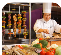
COOKERY & HOSPITALITY