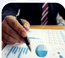
LEADERSHIP & MANAGEMENT