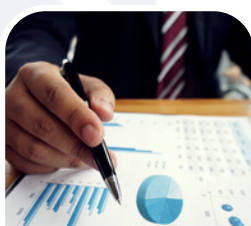
LEADERSHIP & MANAGEMENT