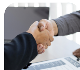
GRADUATE DIPLOMA OF MANAGEMENT