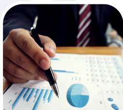
LEADERSHIP & MANAGEMENT