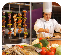
COOKERY & HOSPITALITY