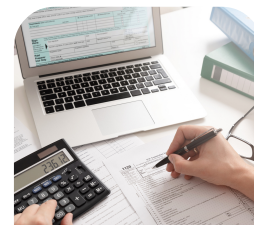
ACCOUNTING & BOOKKEEPING